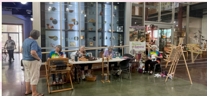
Co-op demo day at the Craftcenter for Chimneyville's Christmas in July.