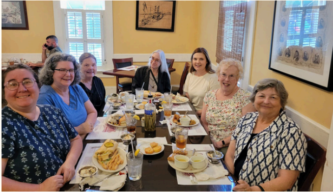
Summer lunch at Walnut Hills in Vicksburg